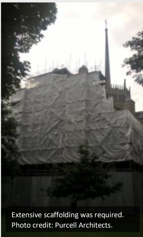
Extensive scaffolding was required.