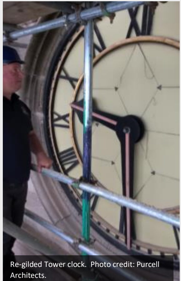
Re-gilded Tower clock.

The repair to the tower roof has prevented further leaking and water damage from occurring. The replacement of the old roof with a new lead one has resulted in the cathedral being much drier and prevents further water damage. The repairs to the stonemasonry of the building and the re-gilding of the clock have provided the cathedral with a more aesthetically pleasing exterior.